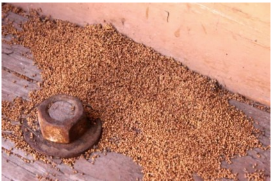
Wood Termite Frass (poop) Dry Wood Termite Infested Wood (larvae and frass)