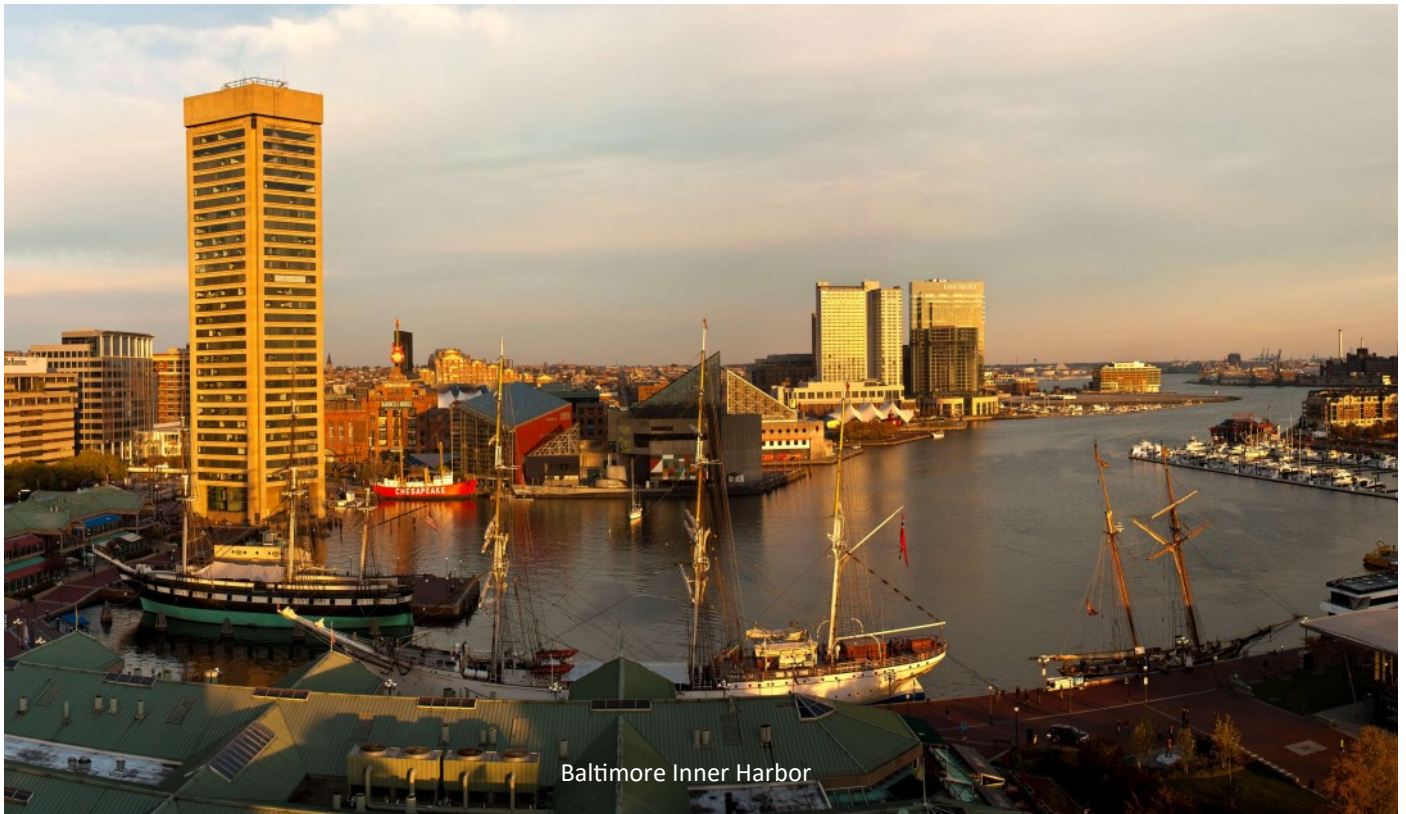
Baltimore Inner Harbor

Hyatt Regency 300 Light Street Baltimore, Maryland 21202