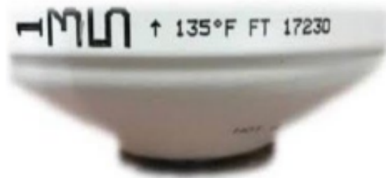
135° F temperature rating printed on side edge

The Coast Guard strongly recommends that vessel owners, inspectors, fire alarm servicing personnel, and third-party surveyors: