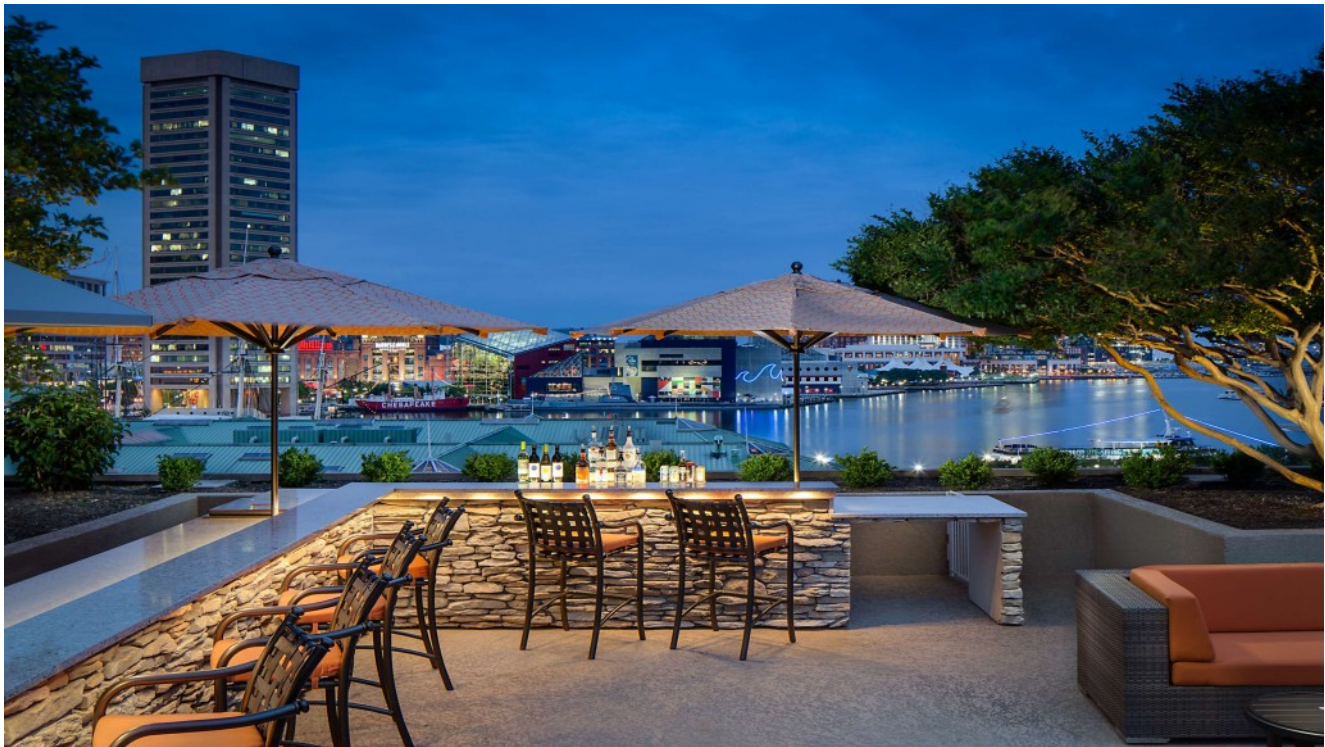
Baltimore Inner Harbor

In closing, remember to always let someone know when you head out on an assignment along with some information on where you are going and when you should be finished. And always tie up that ladder, remember, you are responsible for your own safety and should never take short cuts when it comes to your safety.