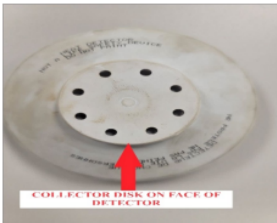
Edwards 280 Series 135° F, non-restorable fixed-temperature (spot-type) heat detector

The below photos show the affected Edwards branded 280 series heat detectors which were installed in the engine rooms of the affected towing vessels. These detectors can easily be identified by the collector disk mounted on the face of the detector and the 135° F temperature rating printed in large font on the side edge of the detector.